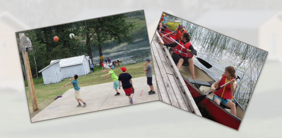
GLOW - God's Love in our World